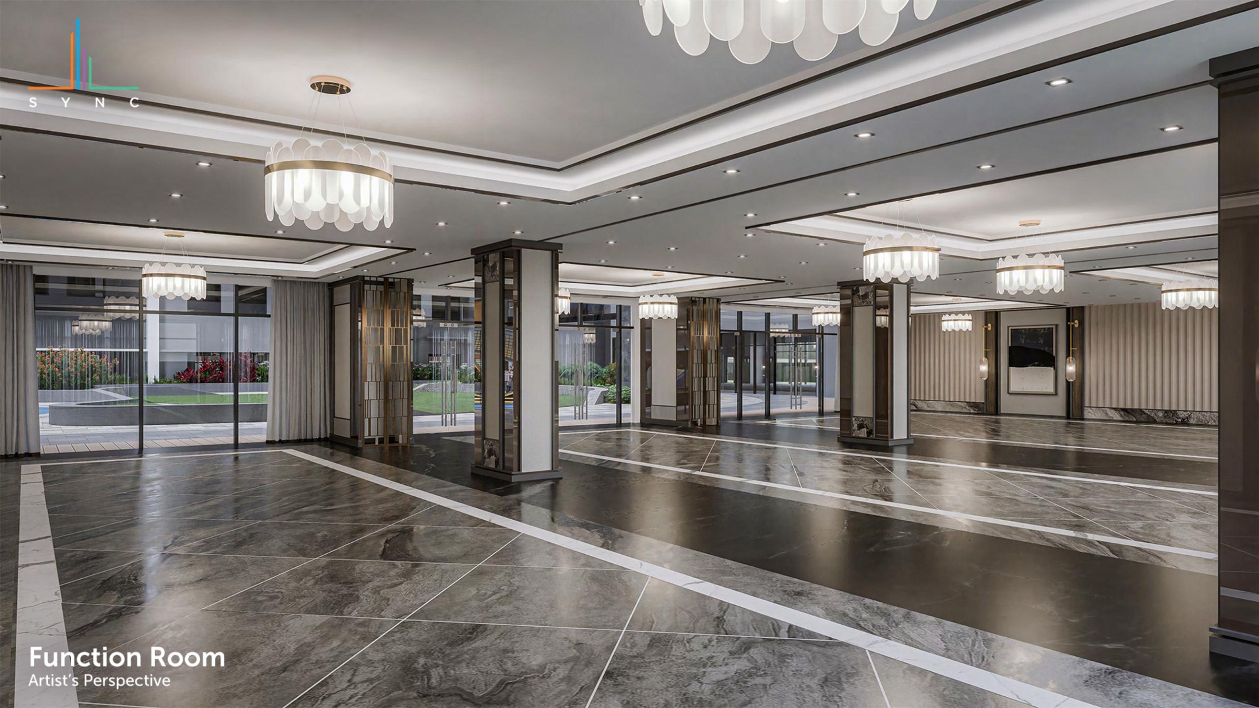
Function Room Artist's Perspective