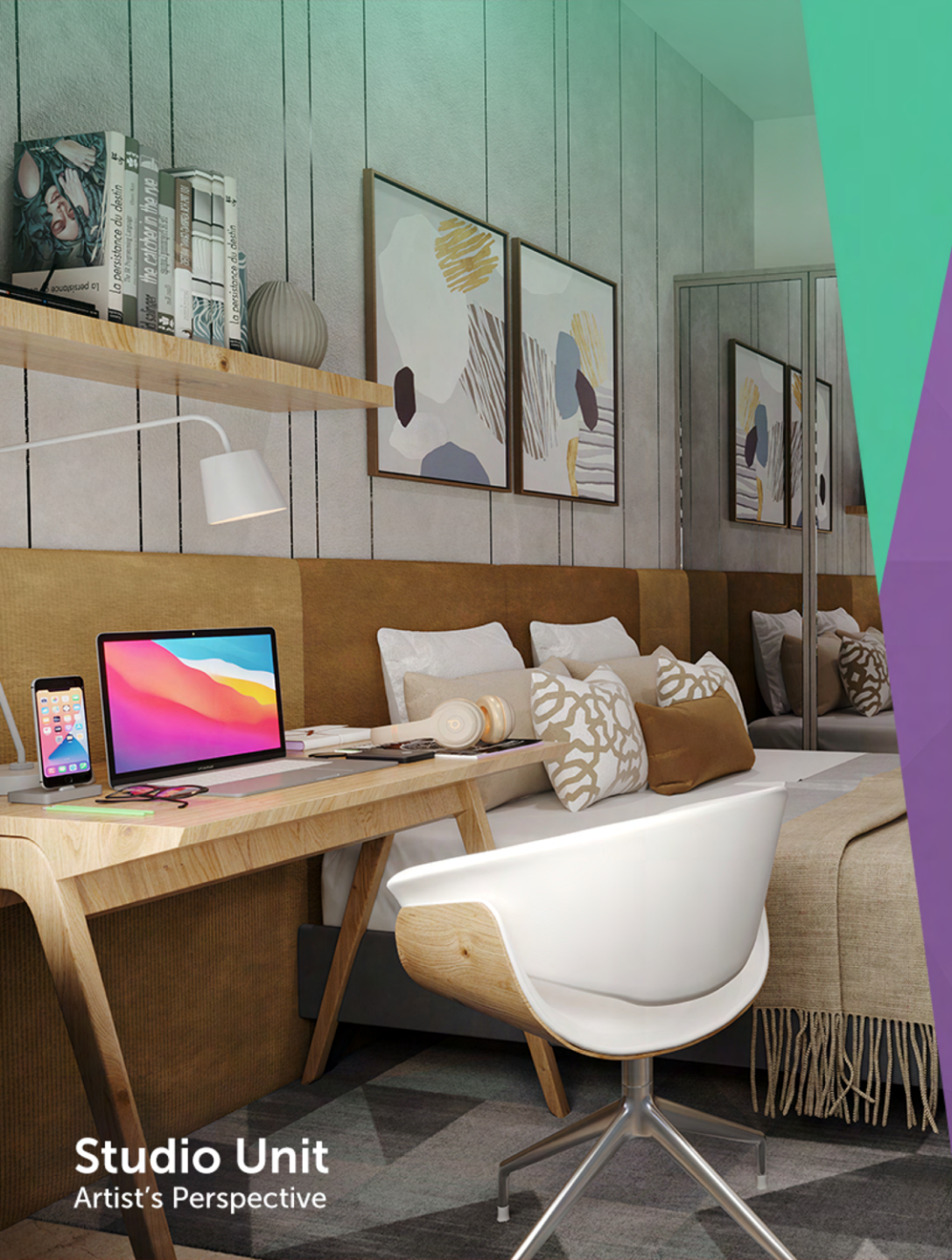
Studio Unit Artist's Perspective