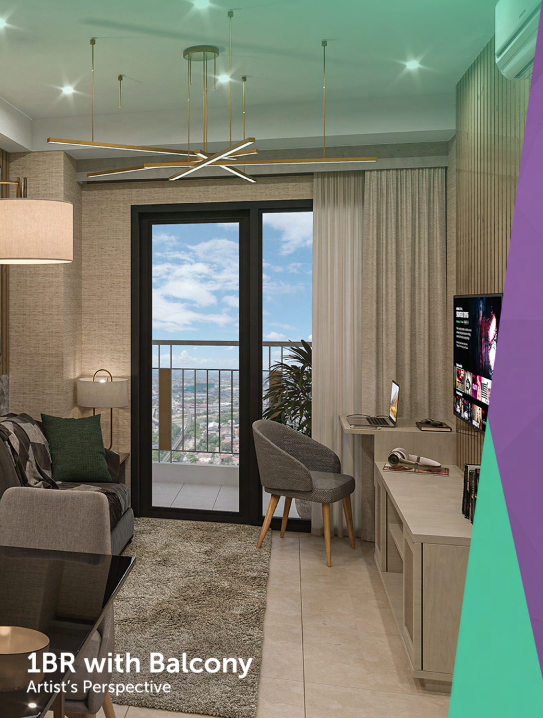
1BR with Balcony Artist's Perspective