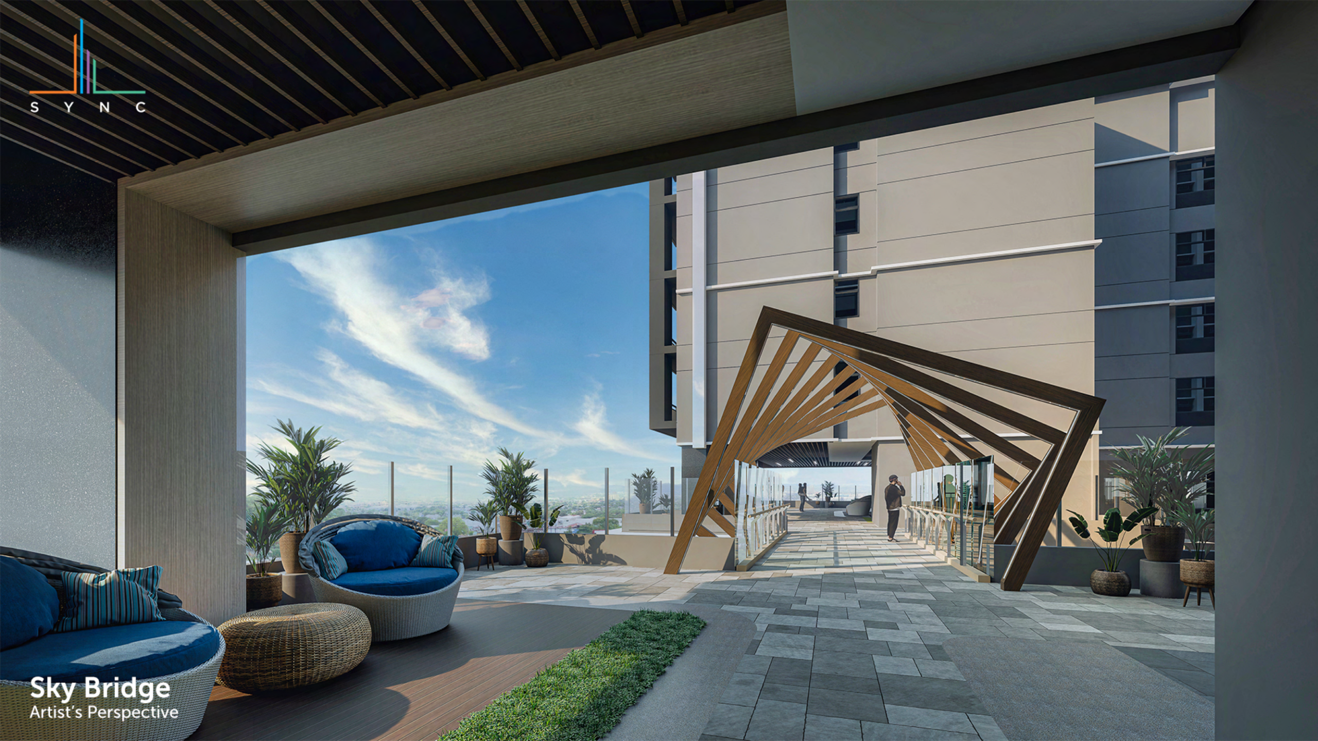
Sky Bridge Artist's Perspective