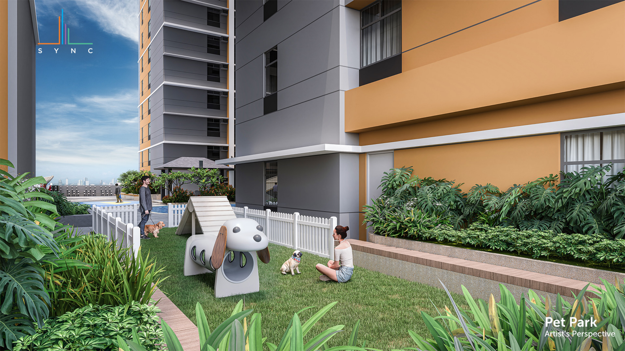
Pet Park Artist's Perspective