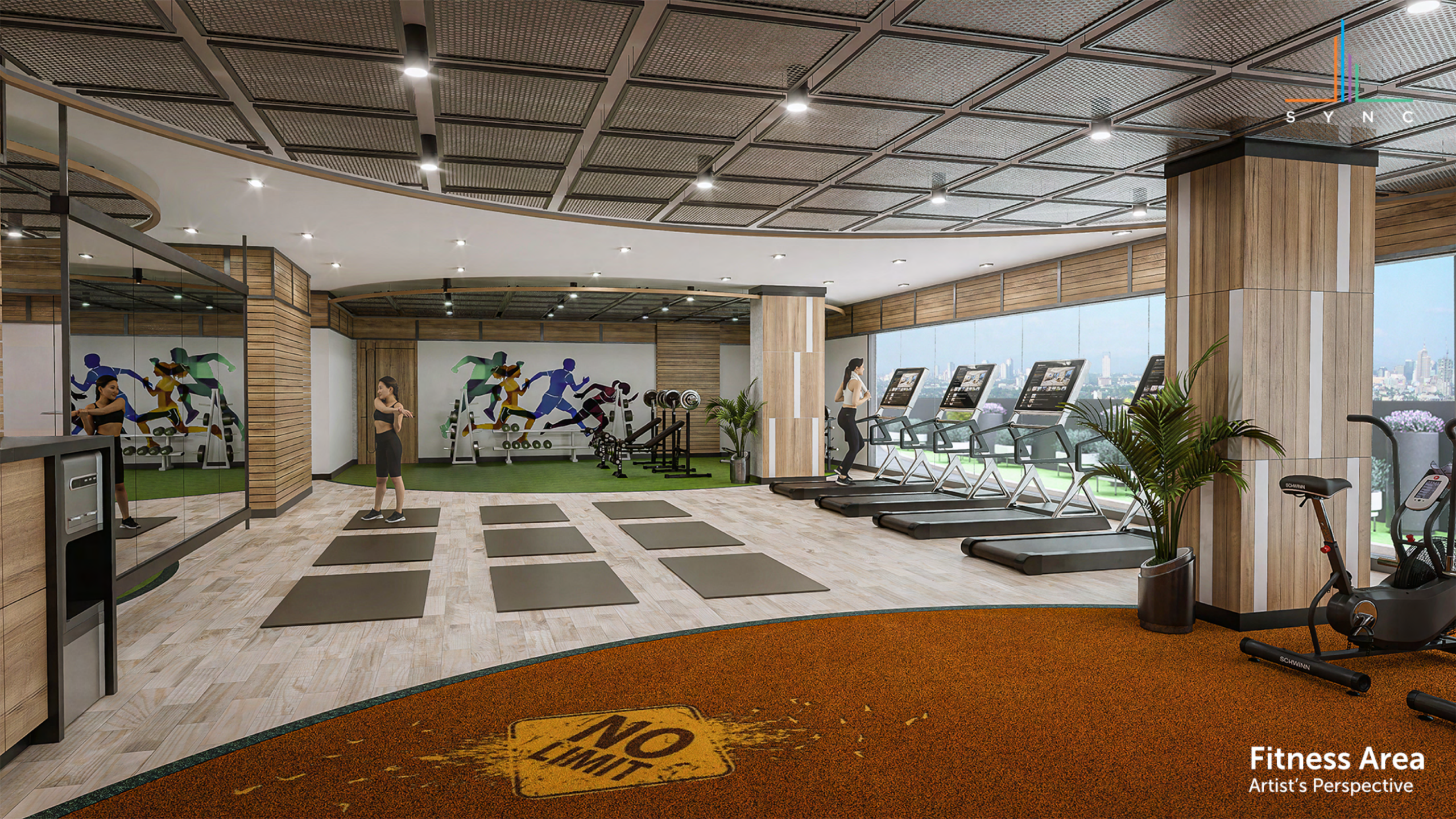
Fitness Area Artist's Perspective